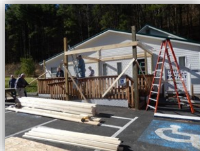
This church has a 75 year old pastor. This church was reopened and we were asked to build a porch roof. We were able to complete this project in two days.