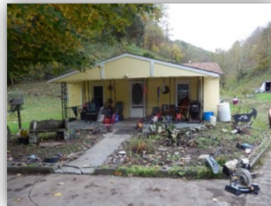
House in Princeton West Virginia that we helped repair the back roof