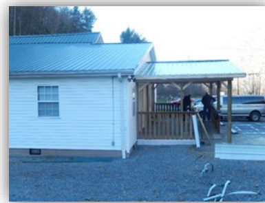
This was the roof after we finished.